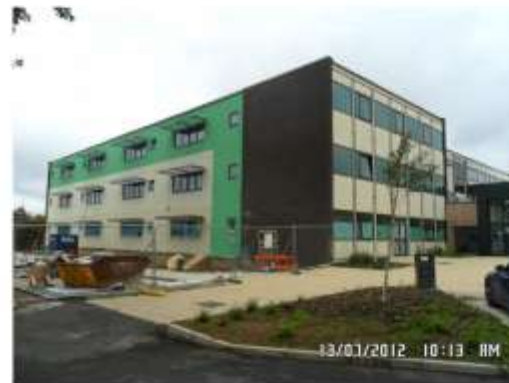
Rendered Front elevation Block 5

The external façade of the Art and English Block has seen a colourful transformation. This can be seen from the main road.