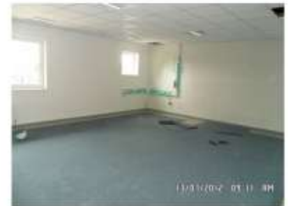
English Classroom Block 5

The removal of the temporary classrooms and associated hard landscaping will signal the end of the project, taking place in January 2013.