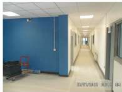
New English / Humanities Corridor Block 5

Phase 4 will commence from July 2012 and is due to be completed in December 2012. The Science department will be transformed into modern working areas and classrooms. A new service road is also planned to be completed.