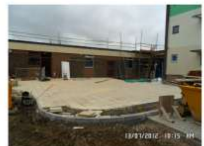
Hard Landscaping outside Block 5

On the right we have included some photos of our current phase 3.