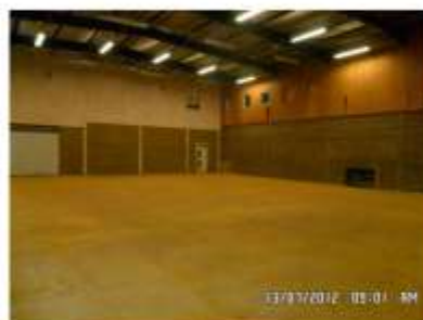
Sports Hall Floor has been removed and waiting a new surface

Every effort will be made to minimise inconvenience to you in these busy periods where possible, with trained operatives organising the various vehicle movement. These will be timed to avoid students' arrival and departure times.