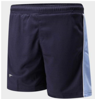
Unisex Short. Navy/Sky