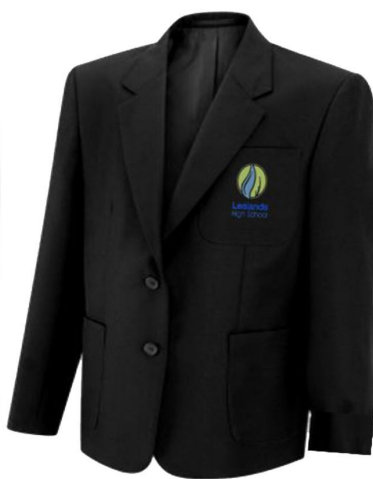
Girls Black Lealands High School Blazer. Compulsory.