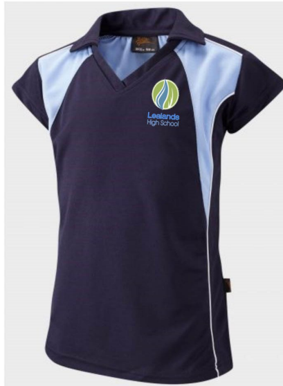
Girls Polo Shirt. Navy/Sky Embroidered