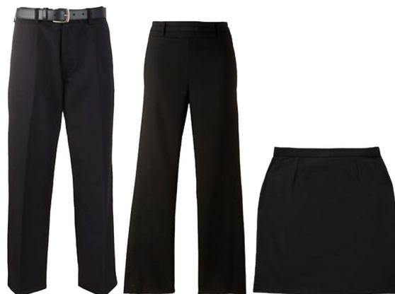
Boys Tailored Trousers Girls Tailored Trousers Girls Tailored Luton Skirt