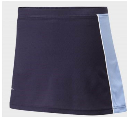
Girls Skort. Navy/Sky