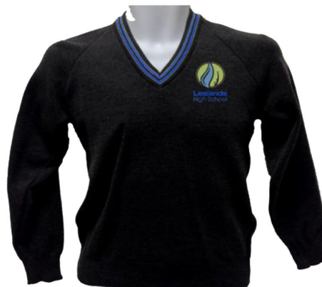
Unisex Lealands High School Jumper. Optional. Must be worn with a blazer, not instead of.