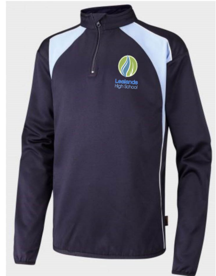
Unisex 1/4 Zip Top. Navy/Sky Embroidered