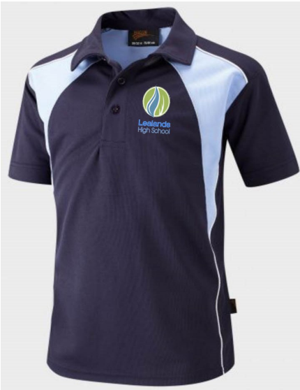
Unisex Polo Shirt. Navy/Sky Embroidered