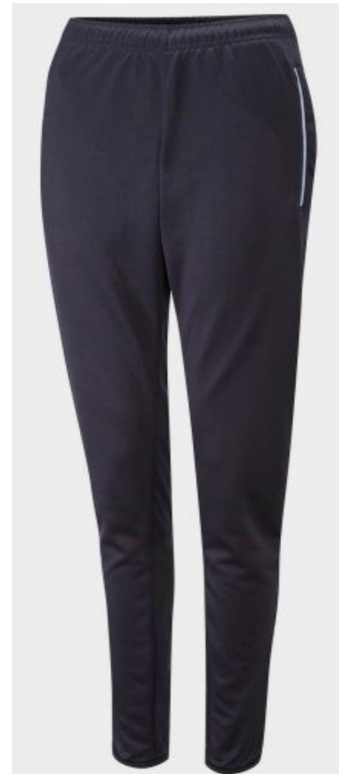
Unisex Slimfit Training Pant. Navy/Sky

Contact Prestige Design & Workwear Ltd for up to date details and prices. Free delivery on orders over £25