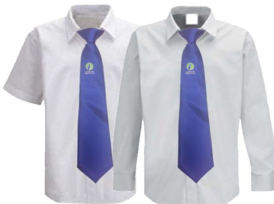
Boys Long or Short Sleeve Shirt Girls Long or Short Sleeve Top Button Blouse.