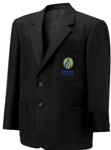
Boys Black Lealands High School Blazer. Compulsory.