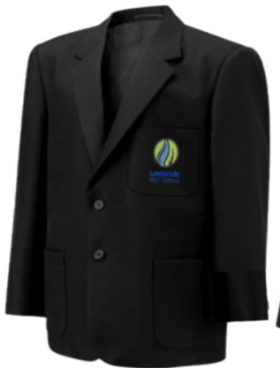
Boys Black Lealands High School Blazer. Compulsory.