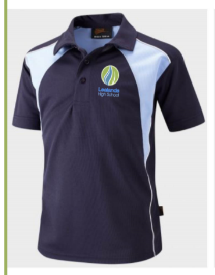
Unisex Polo Shirt. Navy/Sky Embroidered