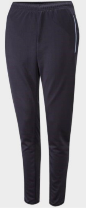
Unisex Slimfit Training Pant. Navy/Sky