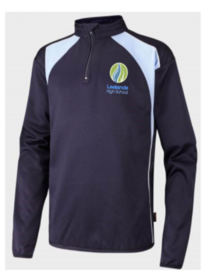
Unisex 1/4 Zip Top. Navy/Sky Embroidered