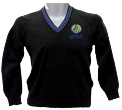
Unisex Lealands High School Jumper. Optional. Must be worn with a blazer, not instead of.