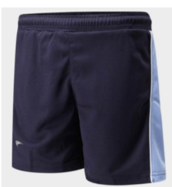
Unisex Short. Navy/Sky