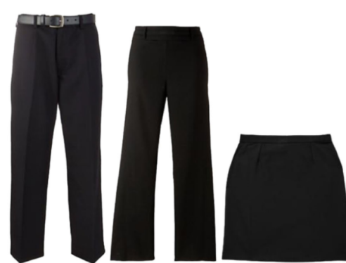
Boys Tailored Trouser Girls Tailored Trouser Girls Tailored Luton Skirt

Clip On Lealands School Tie 16" Clip On Lealands School Tie 19" Clip On Student Leaders Tie, Purple 19"