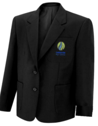
Girls Black Lealands High School Blazer. Compulsory.