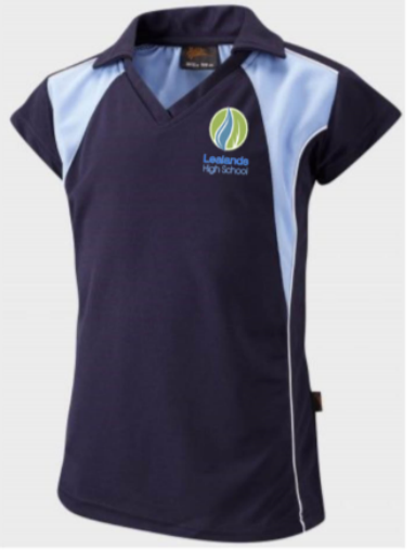
Girls Polo Shirt. Navy/Sky Embroidered